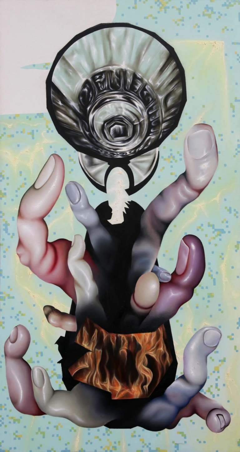
2022 · Oil on canvas · 200 × 100 cm