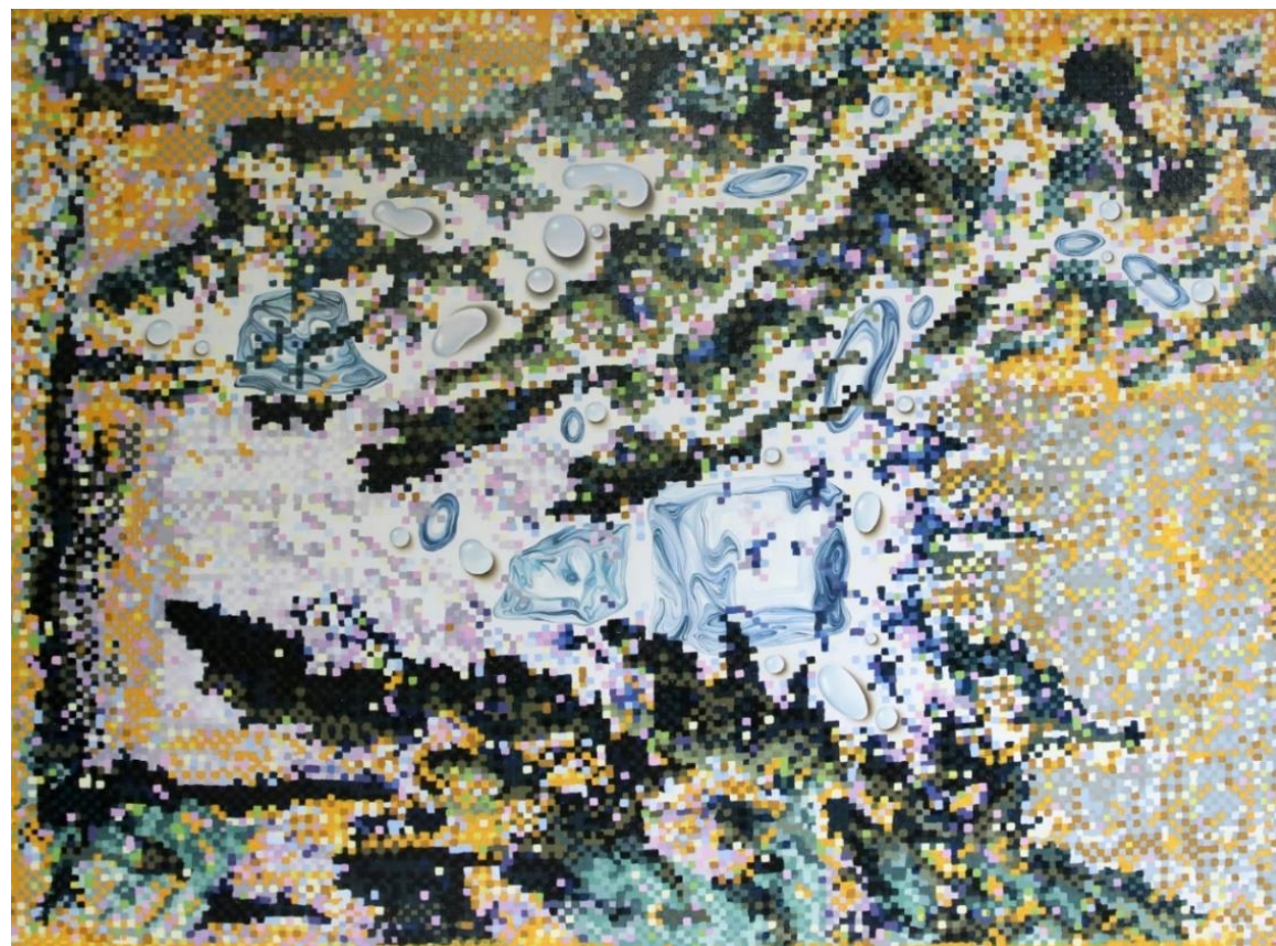
Individual pixel dimensions: 1 × 1 cm

We do not reconcile past trauma; we inhabit its tension, redirecting the hostile gaze at the viewers to question: what it means to be seen?